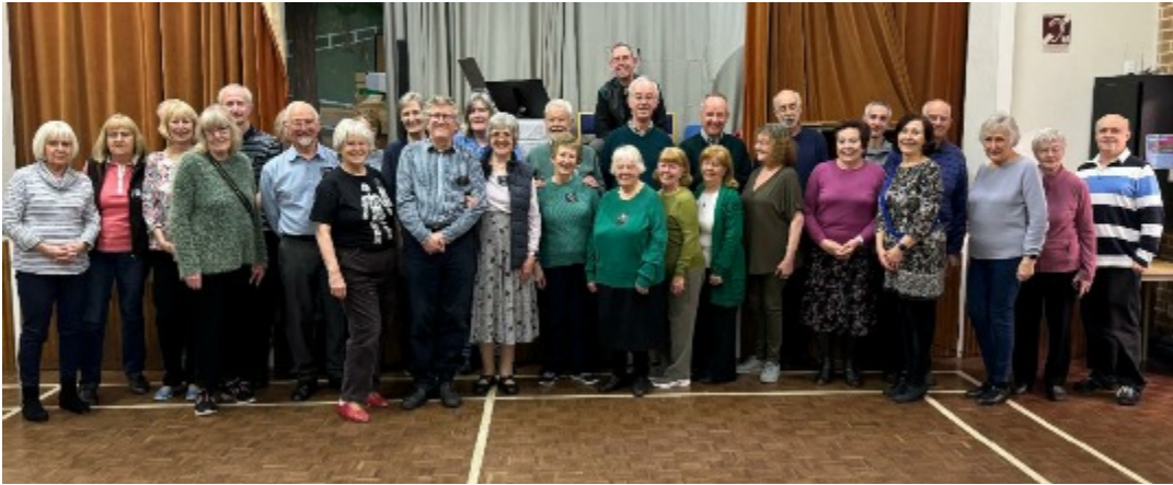
Photo includes new Plus dancers at St Patrick's Evening.

Two of our members enjoyed the Teaching Days even though they knew they would be otherwise engaged when the club dances Plus. Learning the new programme clarifies and extends the Mainstream moves as well as preparing a base for moving forwards if circumstances change.