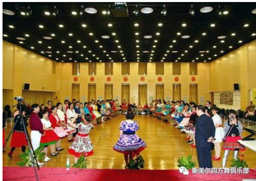
Picture 1-1 Open ceremony of the Dance Party on 17 January, 2020