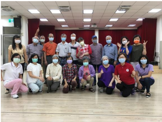
Fig 4. Dancers of the Ding How Square Dance Club wear masks to send Happy New Year wishes to our European friends afar.

It is anticipated that the coronaviruses will go “viral” during the winter. Forza! We hope all of us can overcome the difficulties. Faisons de notre mieux! We know we certainly will do our best to make it. Please stay happy, healthy and resilient, on and off the dance floor. Let’s cross our fingers and hope we shall jump higher in 2021! Alles Gute!