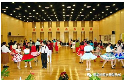
Picture 1-3 Active dancers